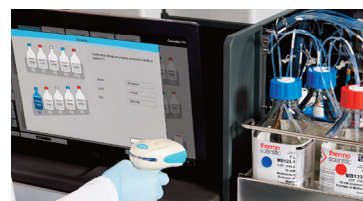
On-board management of bar-coded reagents and consumables with full traceability