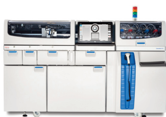
Automated sample preparation, liquid chromatography and mass spectrometry in a single unit

Ready to use assay using the gold standard LC-MS/MS technology in the fully automated Thermo Scientific™ Cascadion™ SM Clinical Analyzer. System software contains all the parameters required for fast and easy set up. Measuring 100% of both the 25-OH Vitamin D 2 and D 3 fractions and reporting Total 25-OH Vitamin D.