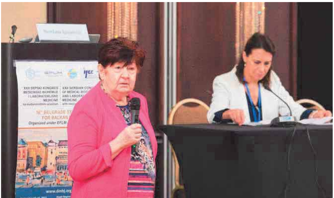
Discussion during Congress Session.