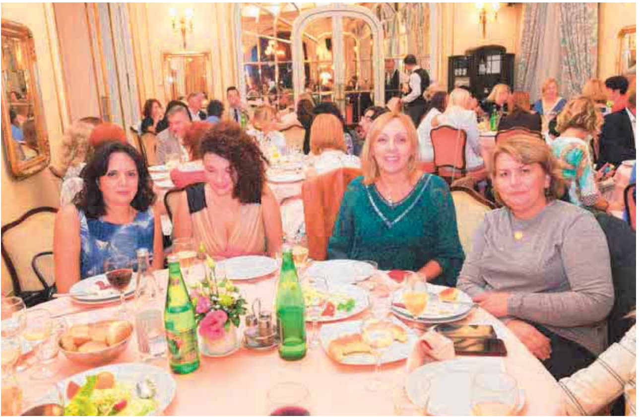
Colleagues from Montenegro during the Congress Dinner.