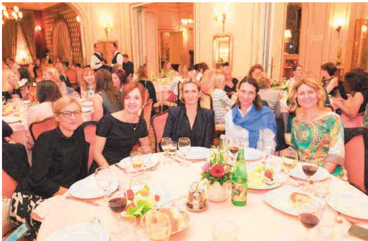
Congress participants during the Congress Dinner.