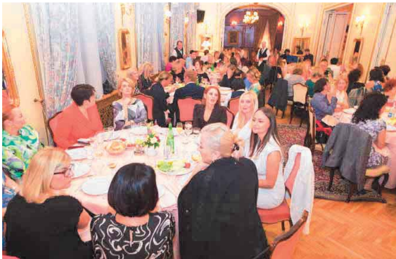
Congress participants during the Congress Dinner.