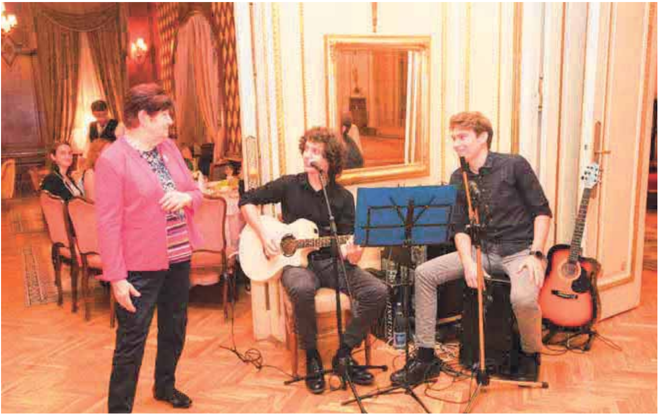
Discussion with excellent musical band.