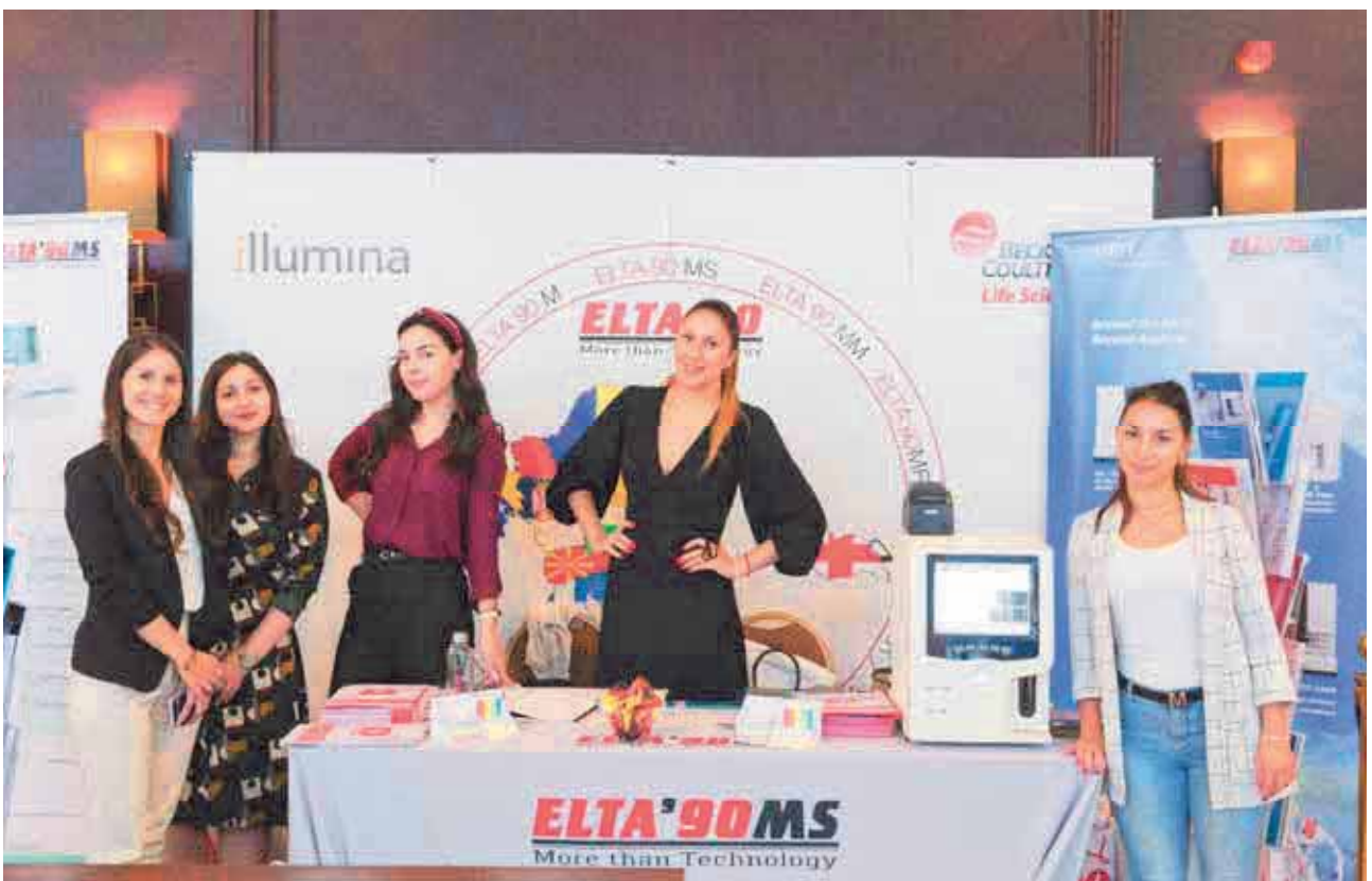
Elta'90 MS stand.