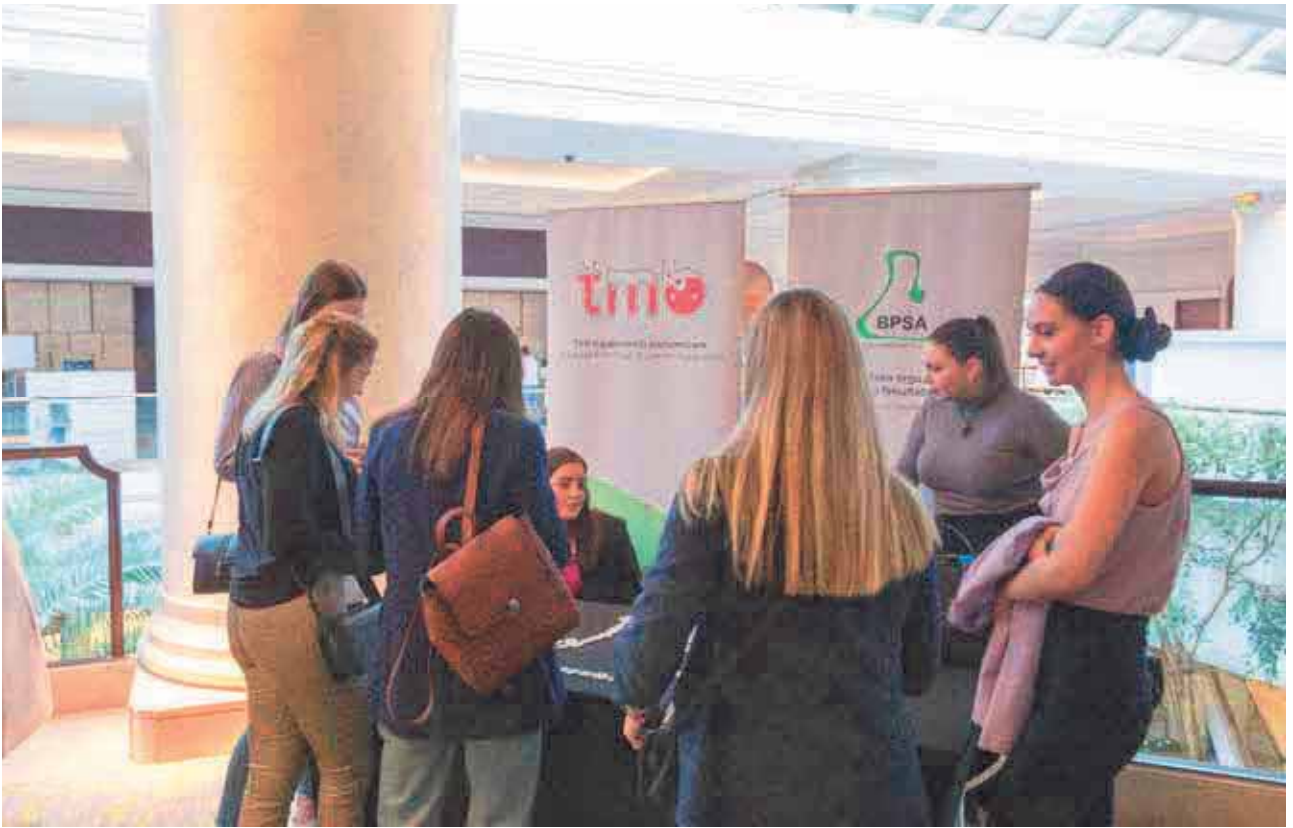
Pharmaceutical Faculty students stand.