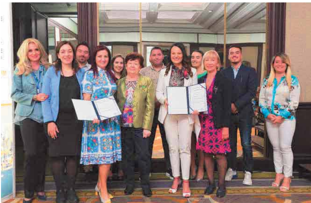
Members of »Aqualab« after receiving the Milica Marković Fund Award.