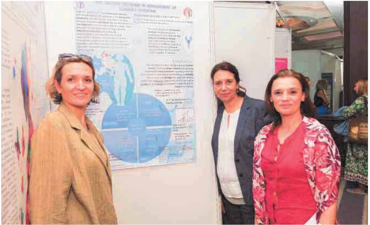
Participants of the Poster Sessions.