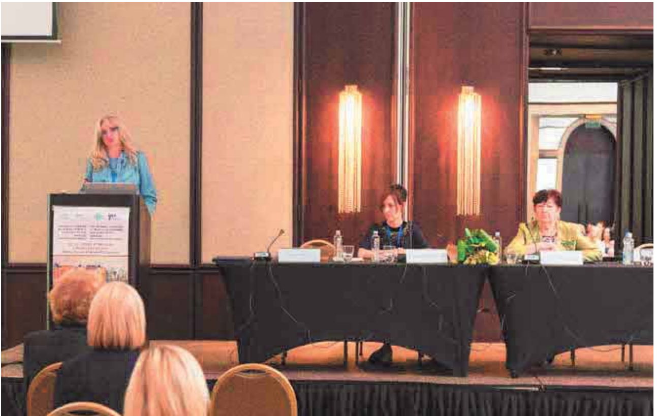
Opening XXIII Serbian Congress & 16th Belgrade Symposium for Balkan Region.