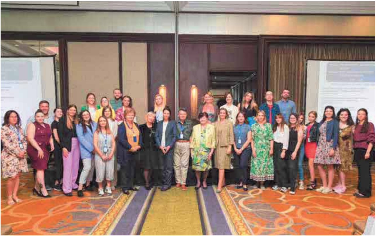
Congress participants after the Poster Session.