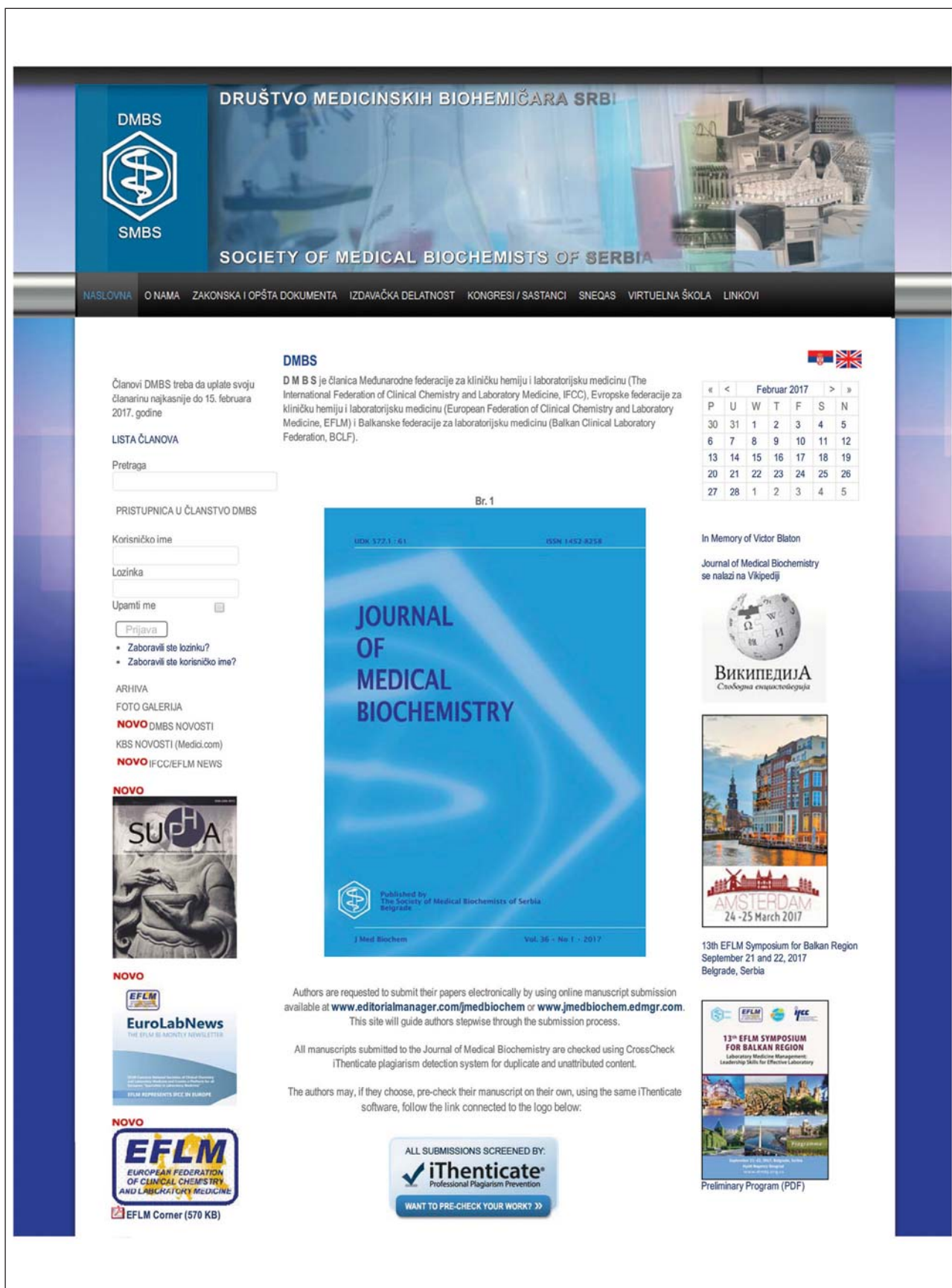
Figure 2 Cover page of the Society Medical Biochemits website ( www.dmbj.org.rs )