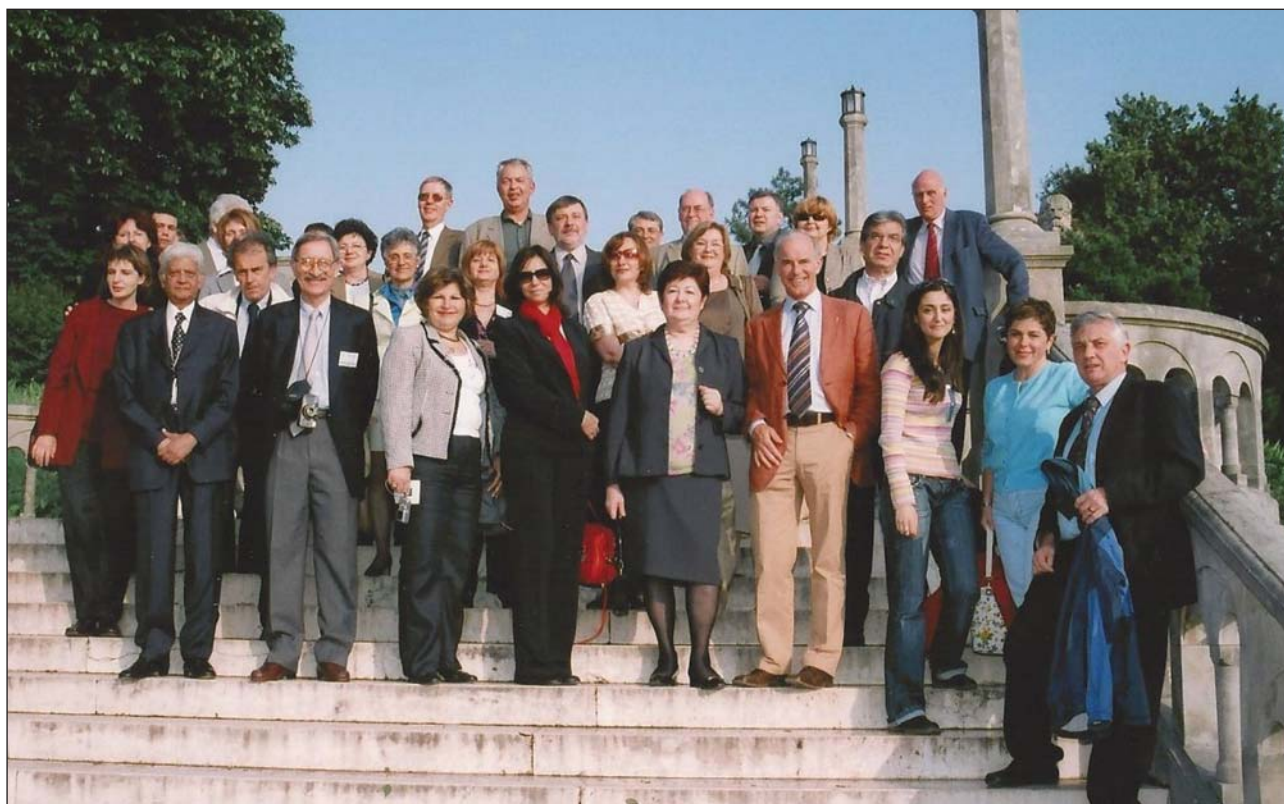
Participants on 50-year Society Anniversary (Belgrade, 2005)

forward in the development of science and quality. At present, the Society is involved in the organization of congresses (biennial), and events such as Biochemical days (every year), and Innovations in laboratory medicine (every year, International Fair on Medical Equipment Medipharm, Belgrade). The XIX th Congress of Medical Biochemistry and Laboratory Medicine will be held this year in Belgrade (2014). The Society regularly organizes courses for continues medical education of clinical chemists. In addition, as a member of the Balkan Clinical Laboratory Federation, the Society of Medical Biochemists of Serbia organized three congresses of the Balkan Clinical Laboratory Federation, the Fourth Congress in 1996 in Budva and the 11 th Congress (Belgrade, 2003) and 20 th BCLF Congress (Belgrade, 2012). Plenary lectures presented at these congresses are published in the monograph Advances in Laboratory Medicine (YuSMB, 1996), »Yugoslav Medical Biochemistry« (2004), and Journal of Medical Biochemistry (2012).