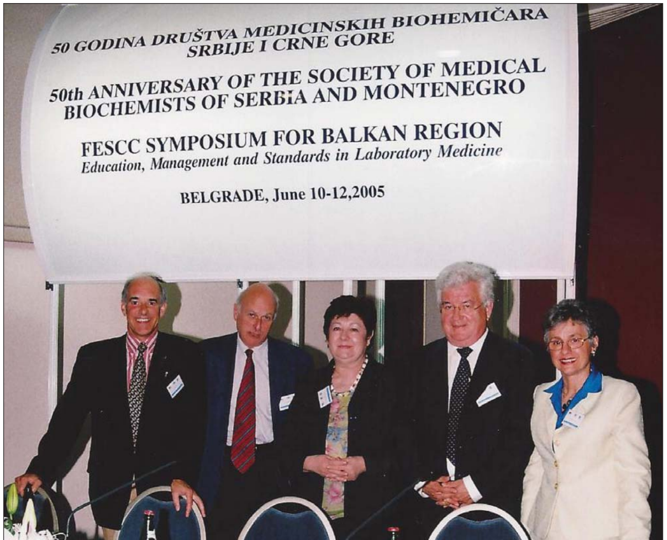
The lecturers on the First FESC Symposium for Balkan Region (Belgrade, 2005)