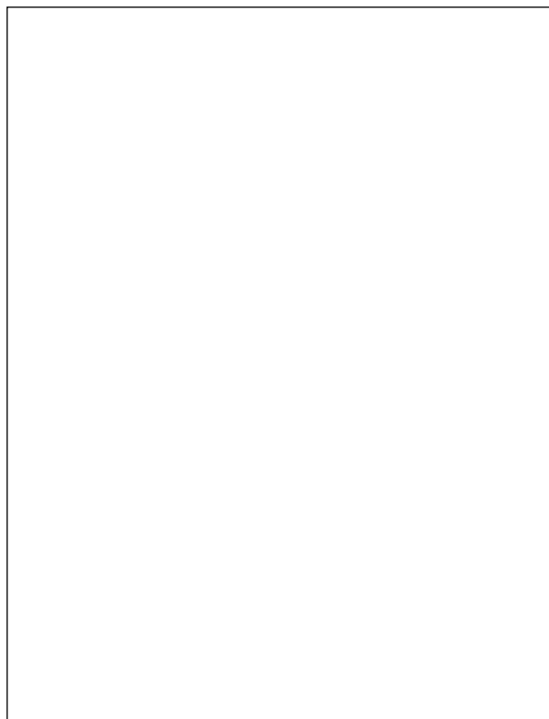
Figure 1 Reverse dot blot analysis with oligonucleotide probes complementary to: the normal \beta -globin gene at the position 110 in the first intron ( \beta_n ), \beta^+ IVSI-110 mutation ( \beta I-110), \beta^0 39 mutation ( \beta 39), \beta^+ IVSI-6 mutation ( \beta I-6), \beta^0 IVSI-1 mutation ( \beta I-1), \beta^0 IVSI-1 mutation ( \beta II-1) and \beta^+ -87 mutation ( \beta -87). Hybridization with amplified DNA from leukocytes of the patient revealed that he is a compound heterozygote for the mutations \beta^+ IVSI-110 and \beta^+ IVSI-6. The detection of hybridization is based on the interaction of biotine (patient's DNA amplified by PCR) and streptavidine-horse radish peroxidase used as the indicator of biotine.

RDB analysis of \beta -globin gene of the patient indicated that the patient is a compound heterozygote for two common mutations in the Mediterranean area ( \beta^+ IVSI-110 and \beta^+ IVSI-6). Amplified DNA did not hybridize to the probes for the other point mutations representing molecular defects in \beta -globin gene detected in our population. The hybridization to \beta_n probe is used as the membrane and hybridization control. (Figure 1).